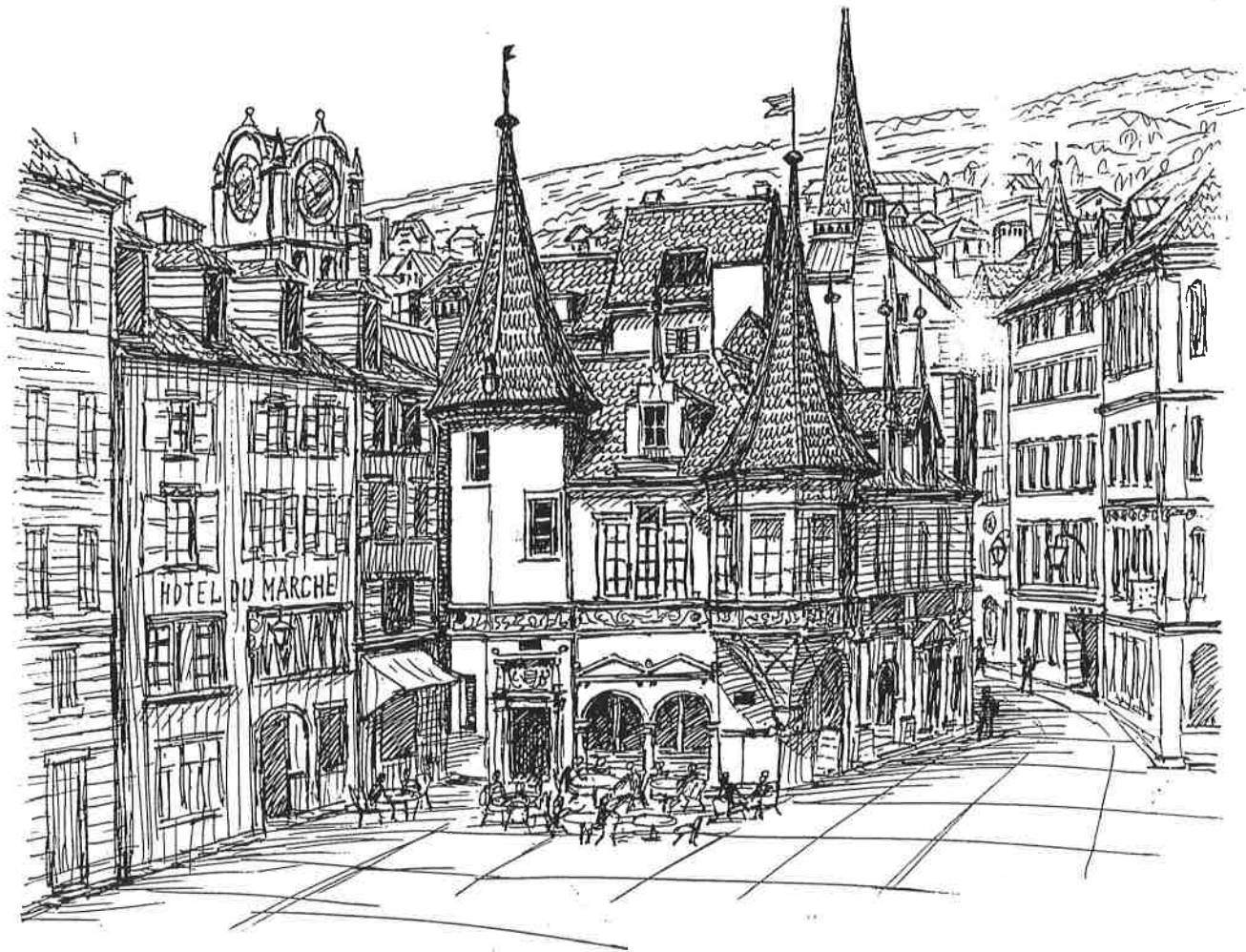
В историческом центре г. Невшатель. 11.9.98.