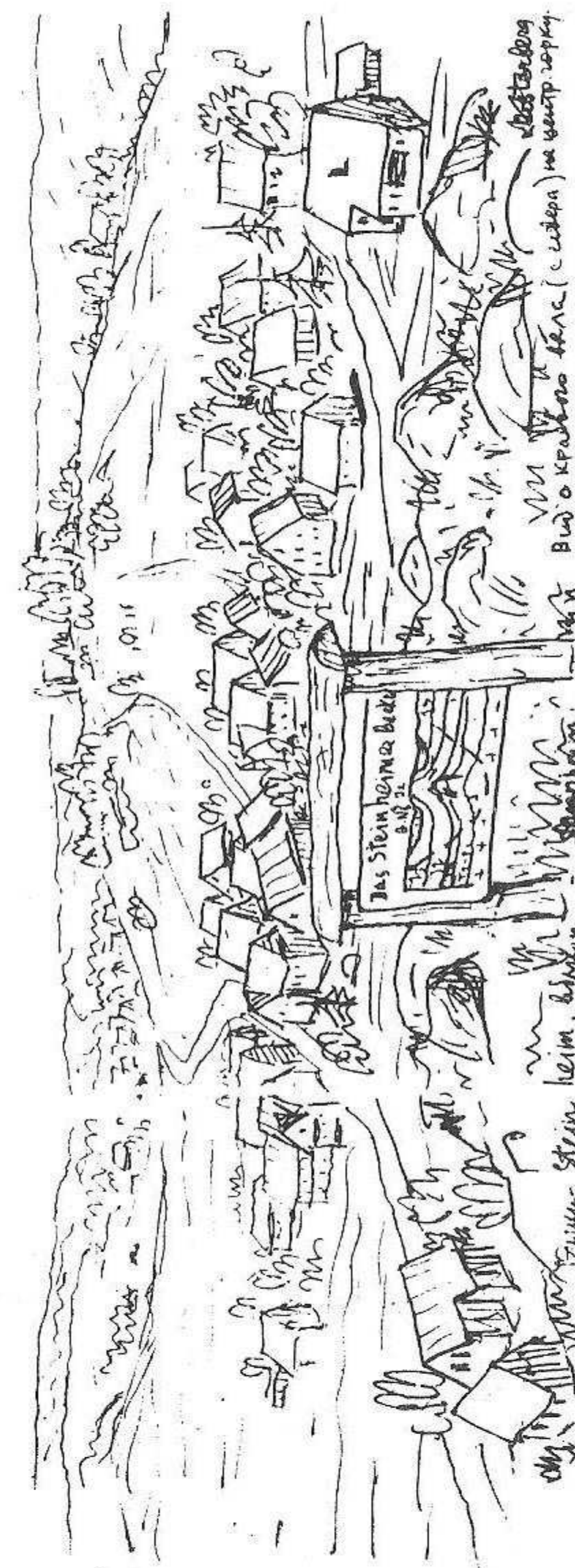
Steinheimer Basin. (Drawing made by E. E. Malinovsky)

The symposium continued on September 14th in Bonn with a visit of old geological literature together with precious folios of the university library including an exhibition on the history of